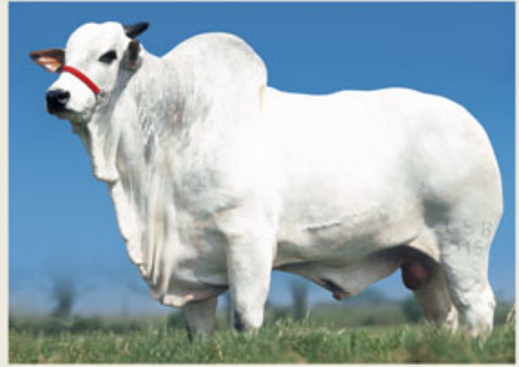
Hijo: TANGO LS (Carmin LS x Fajardo da GB) 1217 kg a los 38 meses